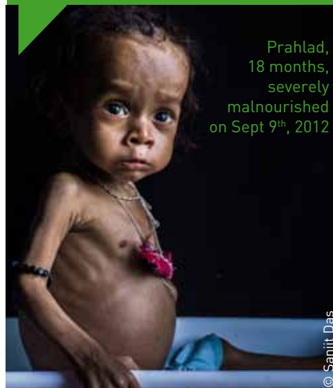
Prahlad, 18 months, severely malnourished on Sept 9 th , 2012

In May 2014, Fight Hunger Foundation conducted an evaluation of the production facility and in September, a partnership was launched to strengthen the manufacturing of this product. Through this project, Fight Hunger Foundation aims to ensure that the production of this treatment against malnutrition at the Sion Hospital is a sound and local model that could be replicated everywhere in the country. ▲